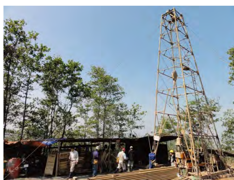
The potential of high quality anthracite which are in demand from Japanese companies (Hong Gai Coal) is expected