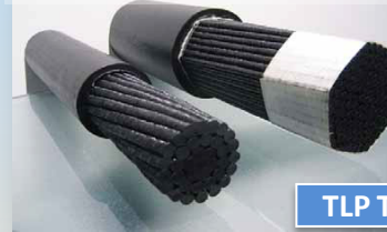
Carbon Fiber Composite Cable